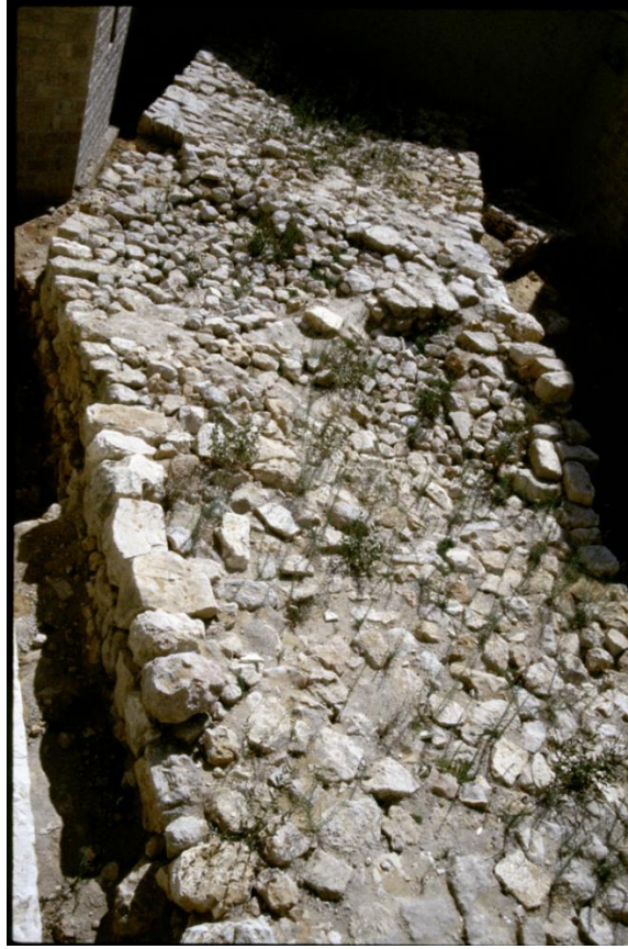
Hezekiah's "Broad Wall" in northwestern part of the old city of Jerusalem

Nehemiah, writing by divine inspiration, records the exact date of this decree: " in the month Nisan, in the twentieth year of Artaxerxes the king " (2:1).