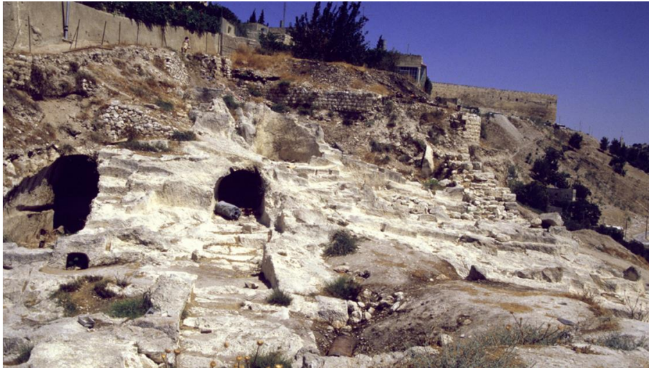
Sepulchres in the City of David – facing north with temple mount in background

After earnest prayer he dared to petition the King “ that thou wouldst send me unto Judah, unto the city of my fathers’ sepulchres, that I may build it ” (2:5). His bold request by the grace of God succeeded, as he tells us: “ And the king granted me, according to the good hand of my God upon me ” (2:8).