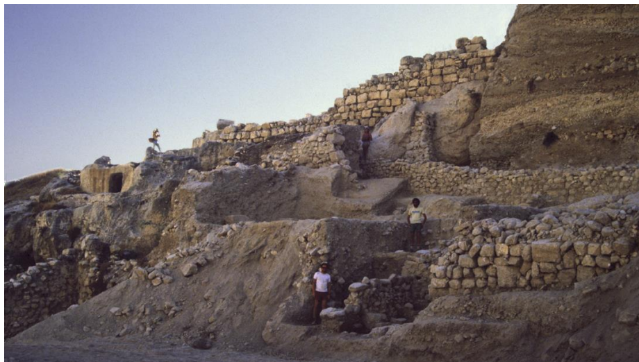
Tomb and walls at southern end of the City of David – facing west