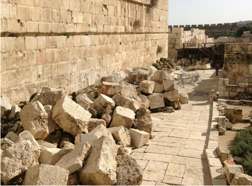
Southwestern wall of the temple mount with evidence of 70 A.D. destruction