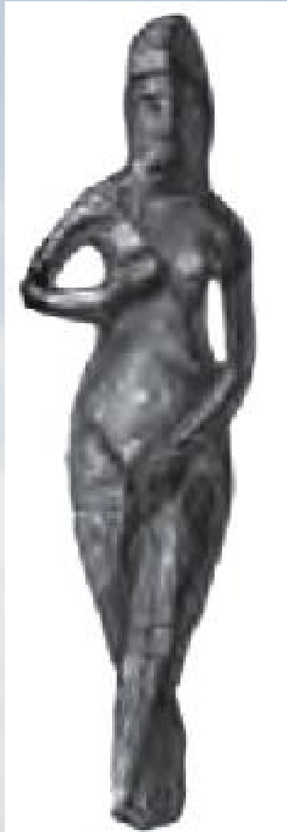
Bible History Online